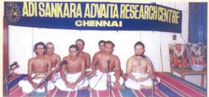
Vedic recital at the Jayanti Celebrations.